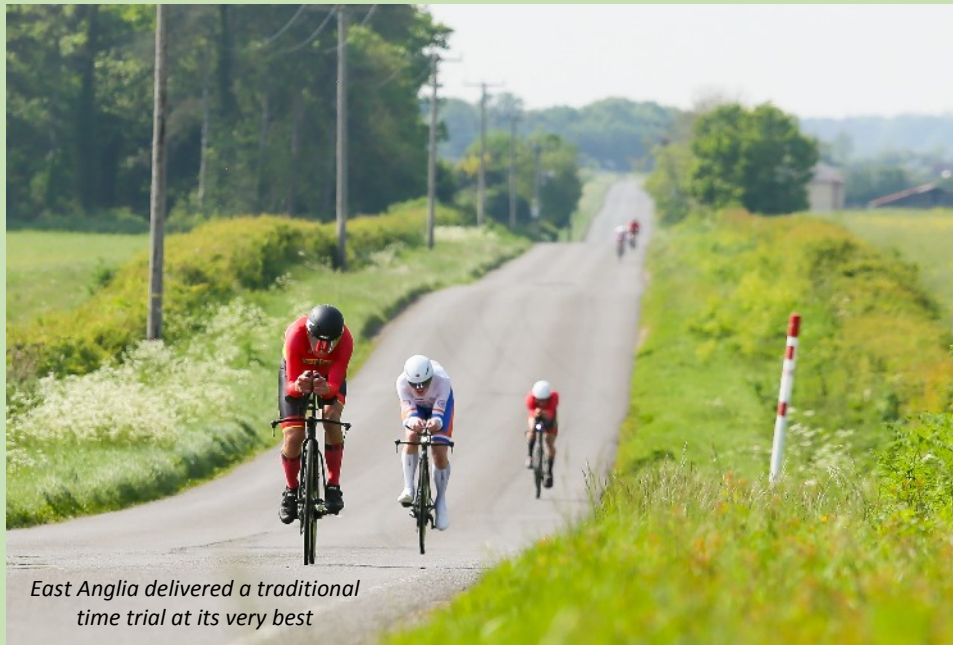
East Anglia delivered a traditional time trial at its very best