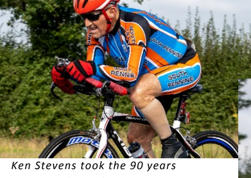
age record to sub 50 minutes