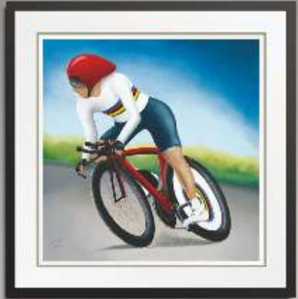
RACE AGAINST TIME