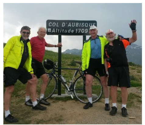
'Last of the Summer Wine' on tour